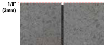
PAVERS OR NATURAL STONES WITHOUT CHAMFER