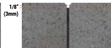
PAVERS OR NATURAL STONES WITH CHAMFER

POLYMERIC SAND REQUIREMENTS Minimum joint width: 1/8" (3 mm) Maximum joint width: 2" (5 cm) Minimum joint depth: 1 1/2" (38 mm)